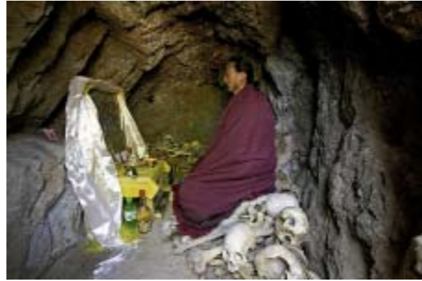
MEDITATING HERMIT, WU TAI SHAN 五台山，静修的隐士