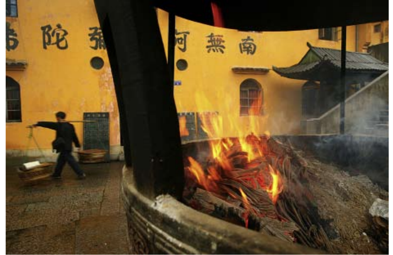
BUDDHIST MONASTERY, JIU HUA SHAN 九华山，甘露寺