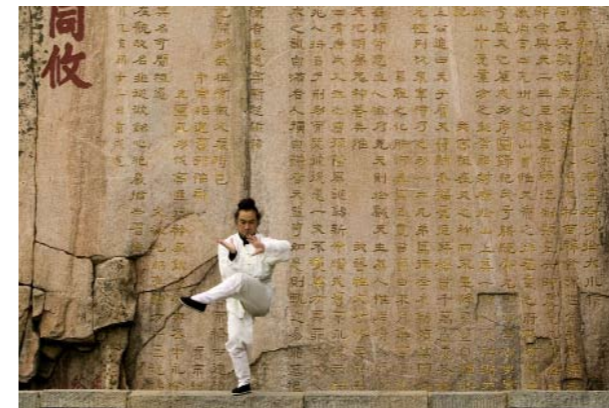
TAI CHI & EMPEROR'S ESSAY, TAI SHAN 泰山，习练太极/皇帝的碑文

Edition of 30 prints - 90 x 60 cm, from RMB 9000