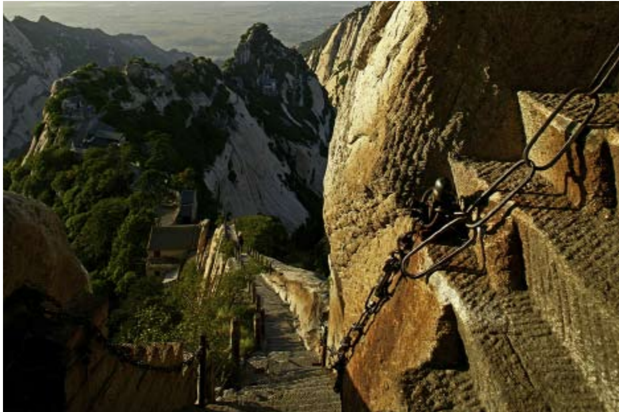
OLD DRAGON'S RIDGE, HUA SHAN 华山苍龙岭

Edition of 30 prints - 90 x 60 cm, from RMB 9000