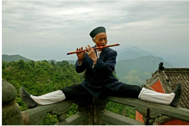
FLUTE PLAYING MONK, WU DANG SHAN 武当山，吹笛的道士