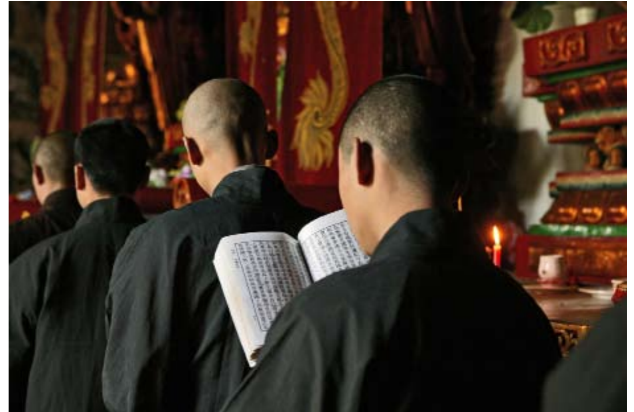
PRAYING MONKS, SHAO LIN, SONG SHAN

迄今为止，卡尔共出版了多达25本摄影专集。2005年，卡尔出版了两本关于中国的摄影专集，分别为《中国的灵山》及《上海，神话》。他目前在德国汉诺威生活和工作。