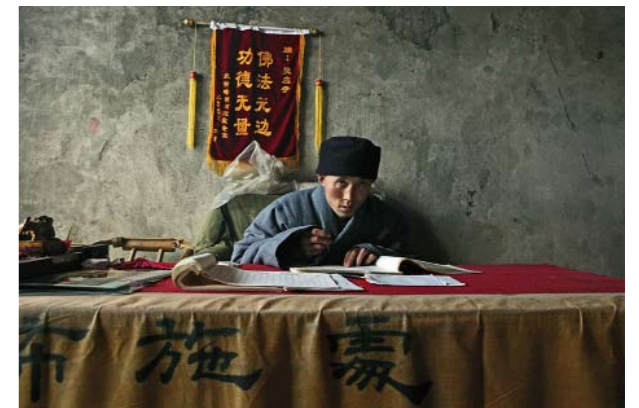
TEMPLE GUARD, WU TAI SHAN 五台山，寺庙看护