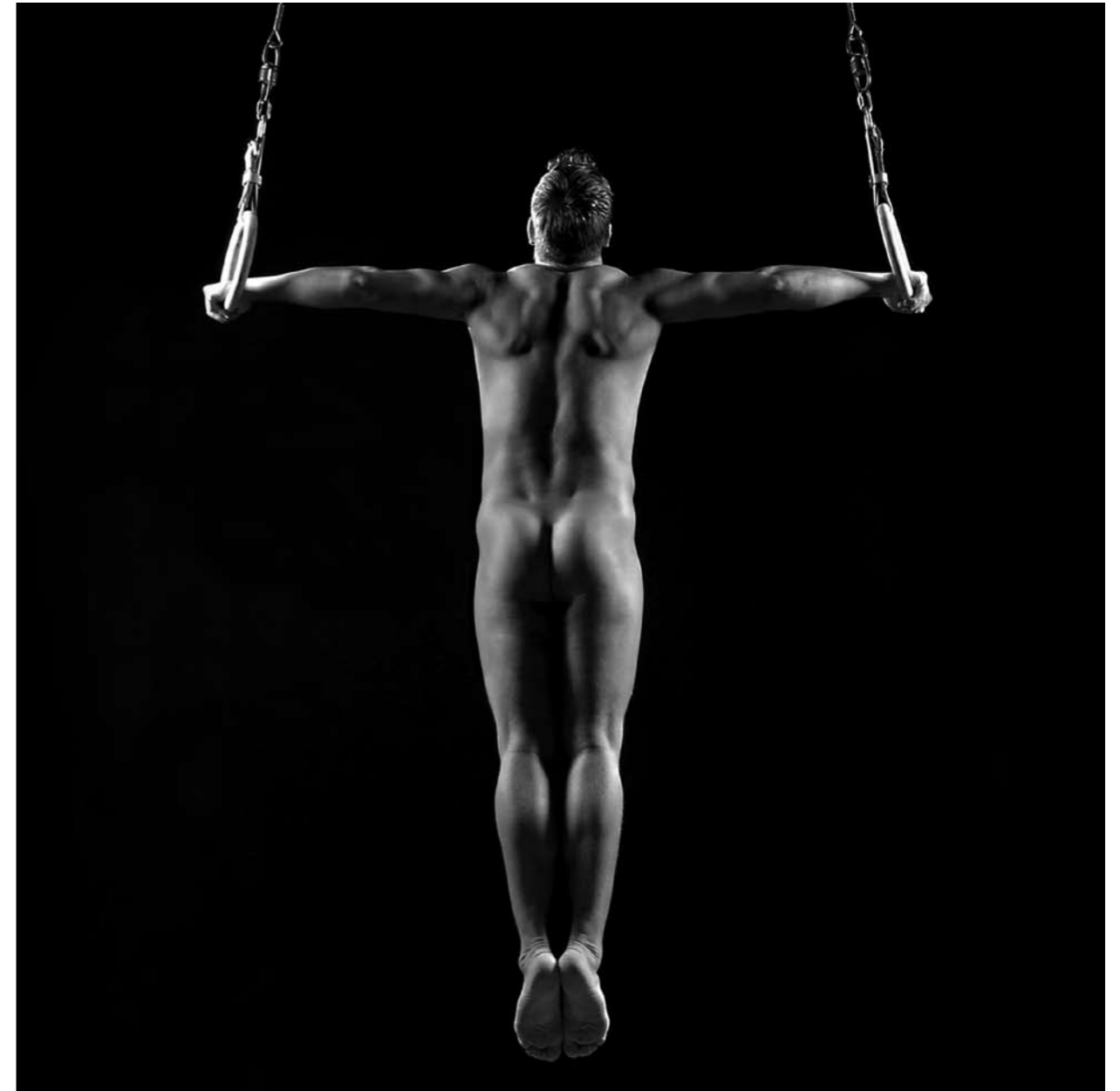
OLYMPIA. RINGS 奥林匹亚·吊环

索妮娅和迈克尔共同创作了五组非常成功的裸体体育运动摄影，在各地的艺术馆举办过展览。通过摄影工作，他们将所得资金捐助于一些慈善项目，如拯救濒危的雨林以及帮助有特殊需要的儿童等等。